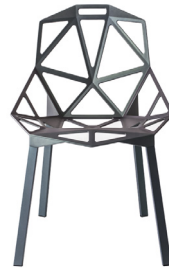
Outdoor use Seat + Legs: Grey Green 5256