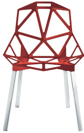
Outdoor use Seat: Red 5085 Legs: Natural, Glossy, Anodised