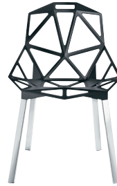
Outdoor use Seat: Grey Anthracite Metallised 5122 Legs: Natural, Glossy, Anodised