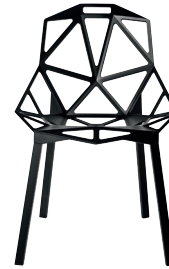
Outdoor use Seat + Legs: Black 5130