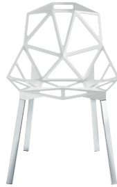
Outdoor use Seat: White 5110 Legs: Natural, Glossy, Anodised