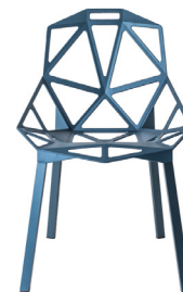
Outdoor use Seat + Legs: Blue 5255