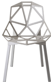
Outdoor use Seat + Legs: Light Grey 5254