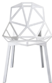
Outdoor use Seat + Legs: White 5110