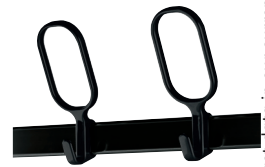
Finish Wall bar: Matt Black Anodised Hooks: Black 5130