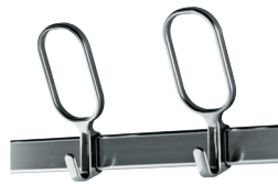
Finish Wall bar: Natural Glossy Anodised Hooks: Polished