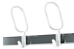
Finish Wall bar: Natural Glossy Anodised Hooks: White 5110